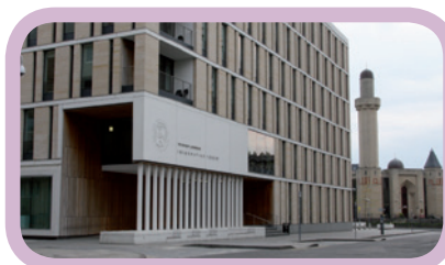
Informatics Building 10 Crichton Street, Edinburgh, EH8 9AB.